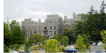
Grey Tower Castle (Arcadia U.)