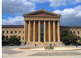
Philadelphia Art Museum