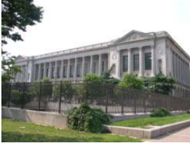
Free Library of Philadelphia